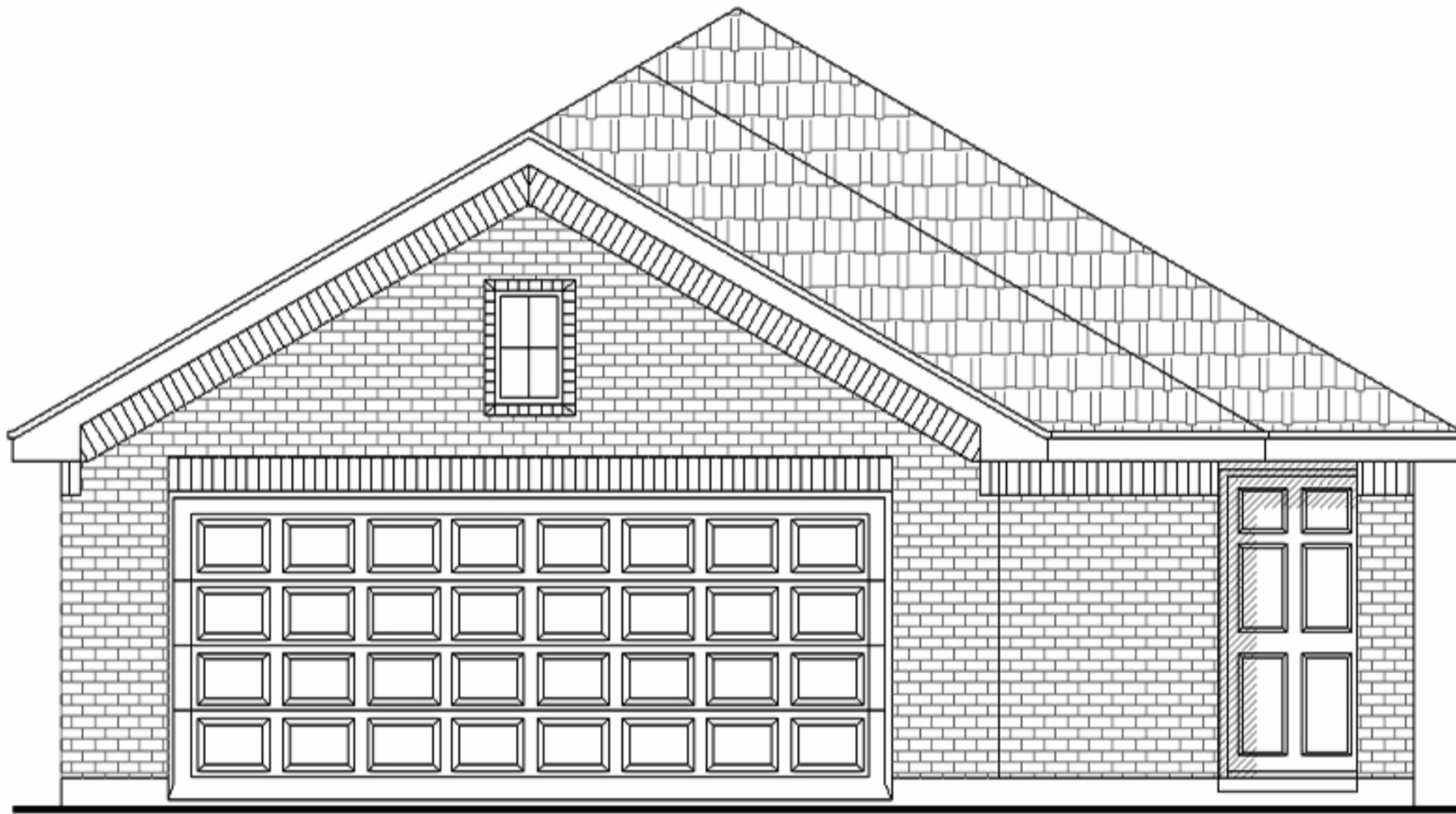
FRONT ELEVATION A PLAN 1412