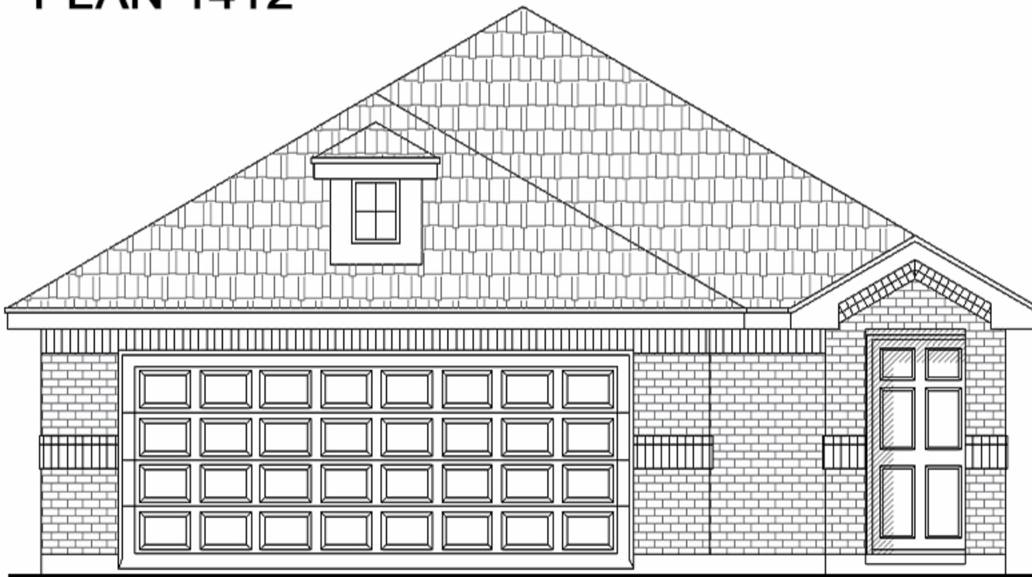
FRONT ELEVATION B PLAN 1412

Brochure plans are artist depictions and may vary from actual plan. Square footages, room dimensions, prices, specifications, materials and availability of homes by community may vary, and are subject to change without notice.