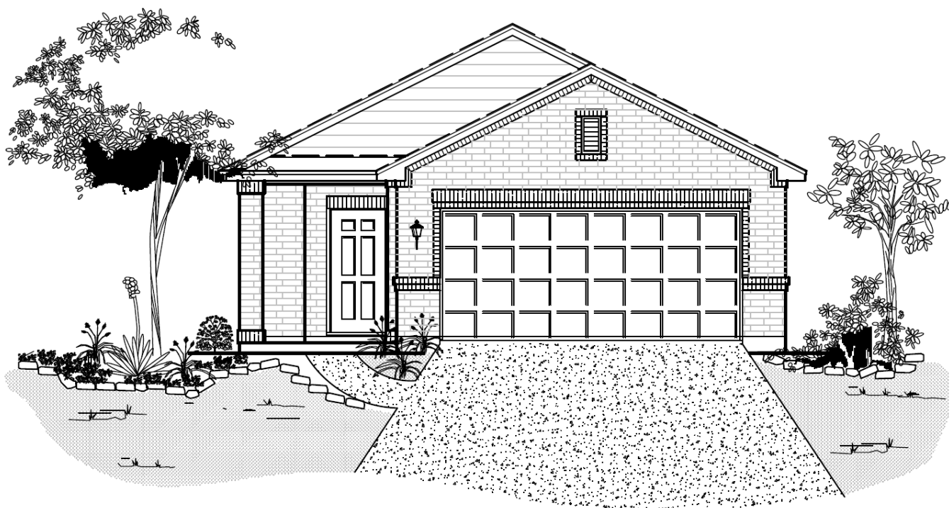
FRONT ELEVATION M2

Brochure plans are artist depictions and may vary from actual plan. Square footages, room dimensions, prices, specifications, materials, and availability of homes by community may vary and are subject to change without notice.