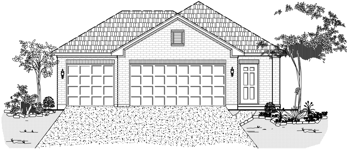
FRONT ELEVATION "M"