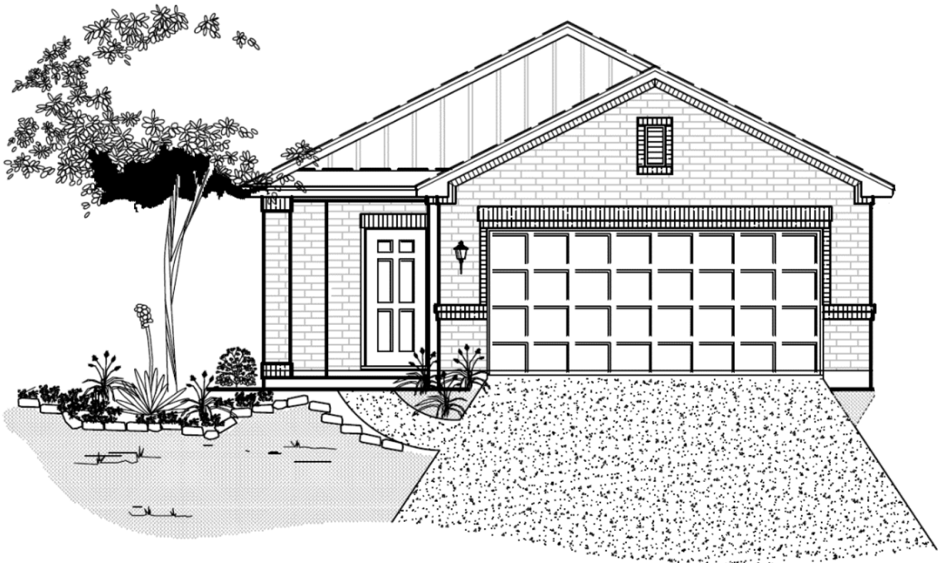
FRONT ELEVATION M2

Brochure plans are artist depictions and may vary from actual plan. Square footages, room dimensions, prices, specifications, materials, and availability of homes by community may vary and are subject to change without notice.