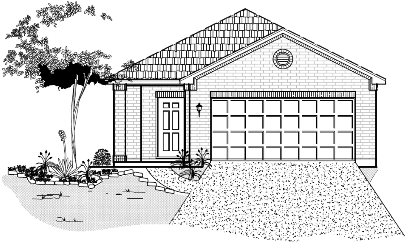
FRONT ELEVATION M