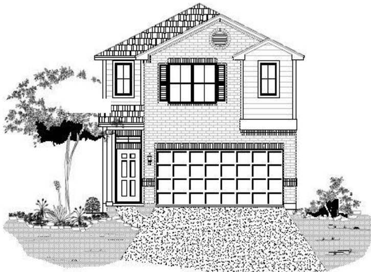
FRONT ELEVATION E

Brochure plans are artist depictions and may vary from actual plan. Square footages, room dimensions, prices, specifications, materials, and availability of homes by community may vary and are subject to change without notice.