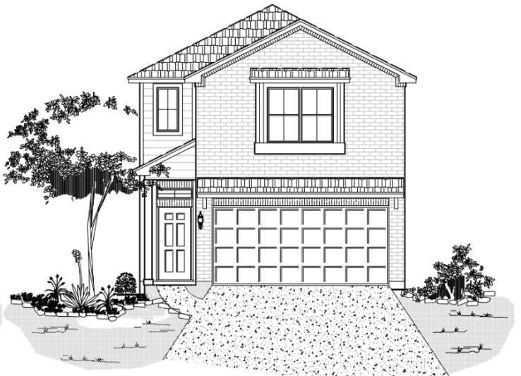
FRONT ELEVATION D