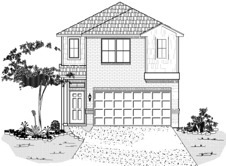
FRONT ELEVATION C