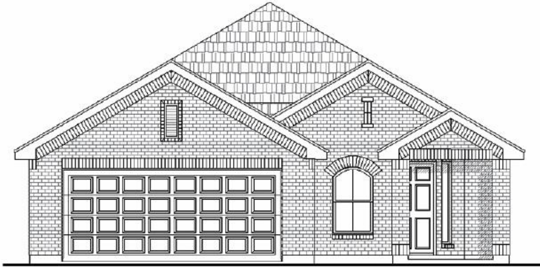
FRONT ELEVATION A PLAN 1605