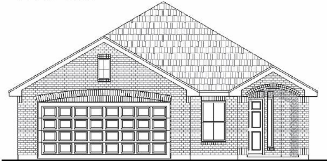
FRONT ELEVATION B PLAN 1605

Brochure plans are artist depictions and may vary from actual plan. Square footages, room dimensions, prices, specifications, materials, and availability of homes by community may vary and are subject to change without notice.