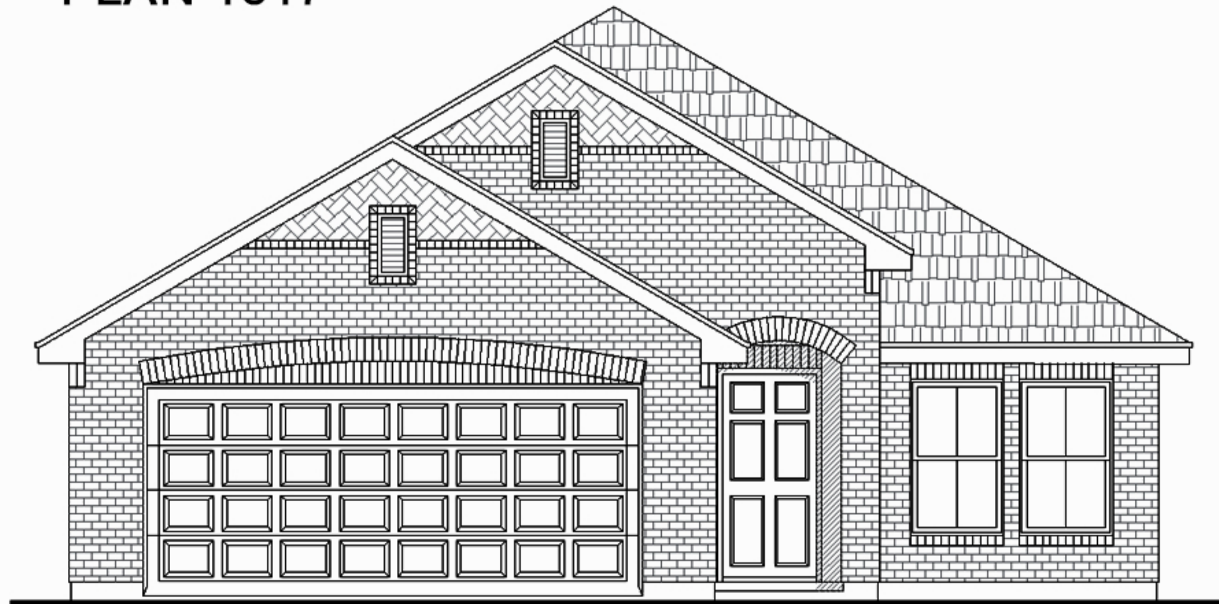
FRONT ELEVATION B PLAN 1617

Brochure plans are artist depictions and may vary from actual plan. Square footages, room dimensions, prices, specifications, materials and availability of homes by community may vary, and are subject to change without notice.