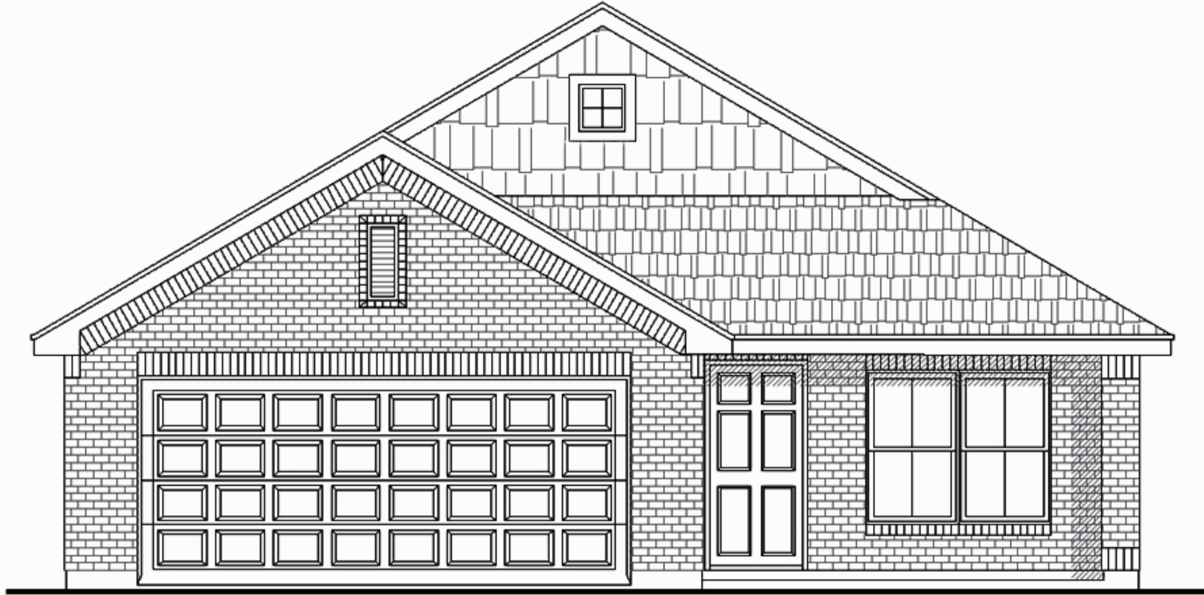
FRONT ELEVATION A PLAN 1617