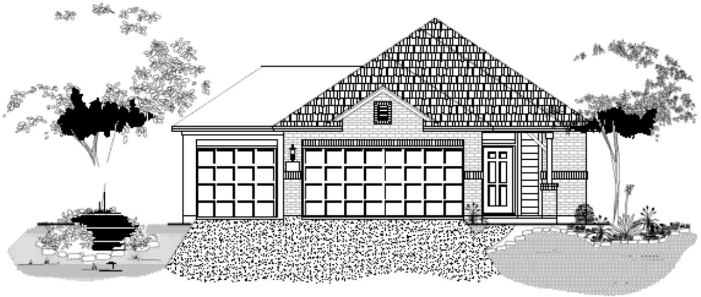
FRONT ELEVATION "A" Plan 1689