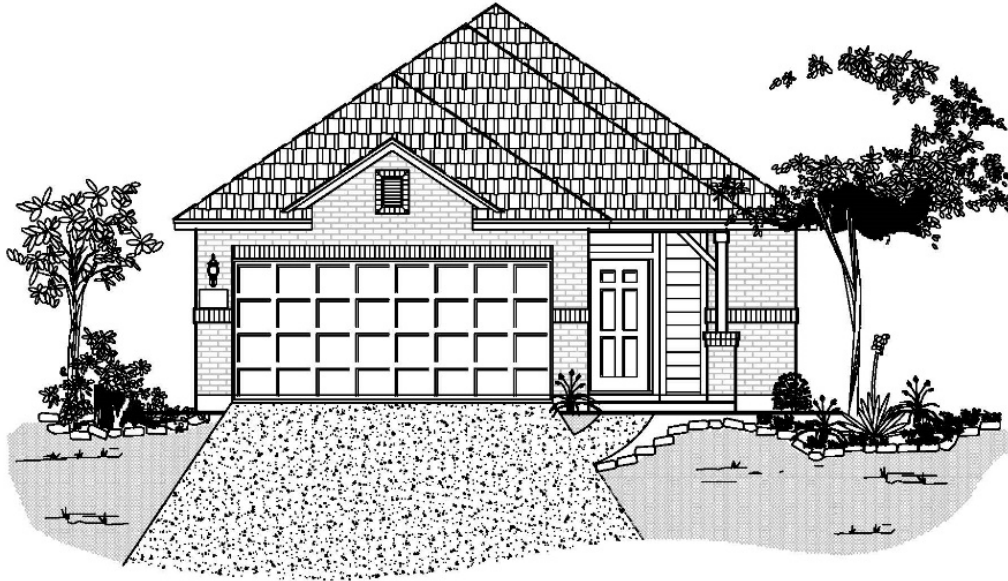
FRONT ELEVATION "A" Plan 1689