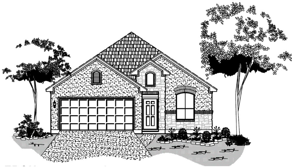
FRONT ELEVATION A