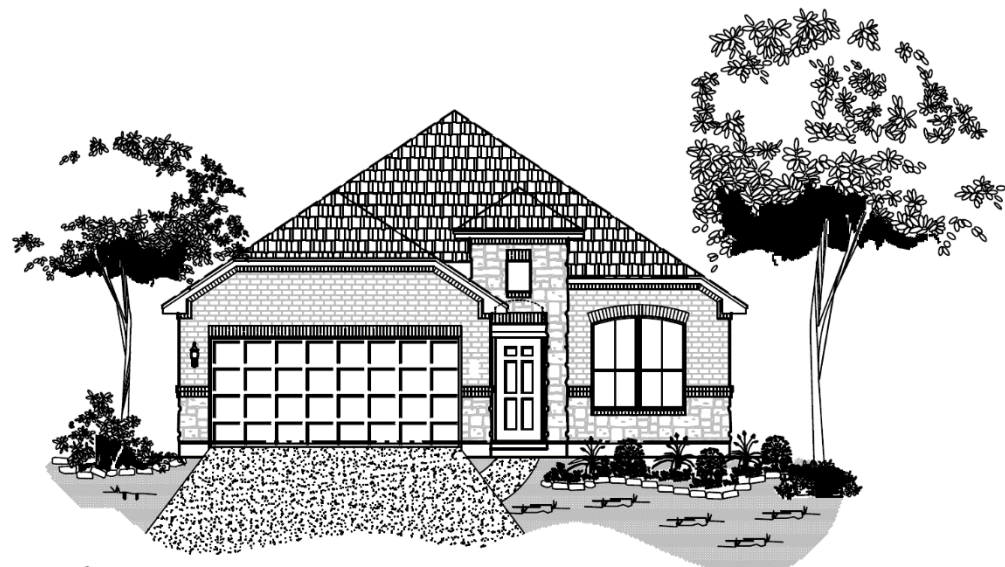
FRONT ELEVATION C

Brochure plans are artist depictions and may vary from actual plan. Square footages, room dimensions, prices, specifications, materials, and availability of homes by community may vary and are subject to change without notice.