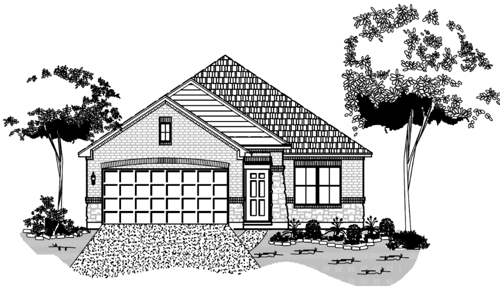
FRONT ELEVATION B