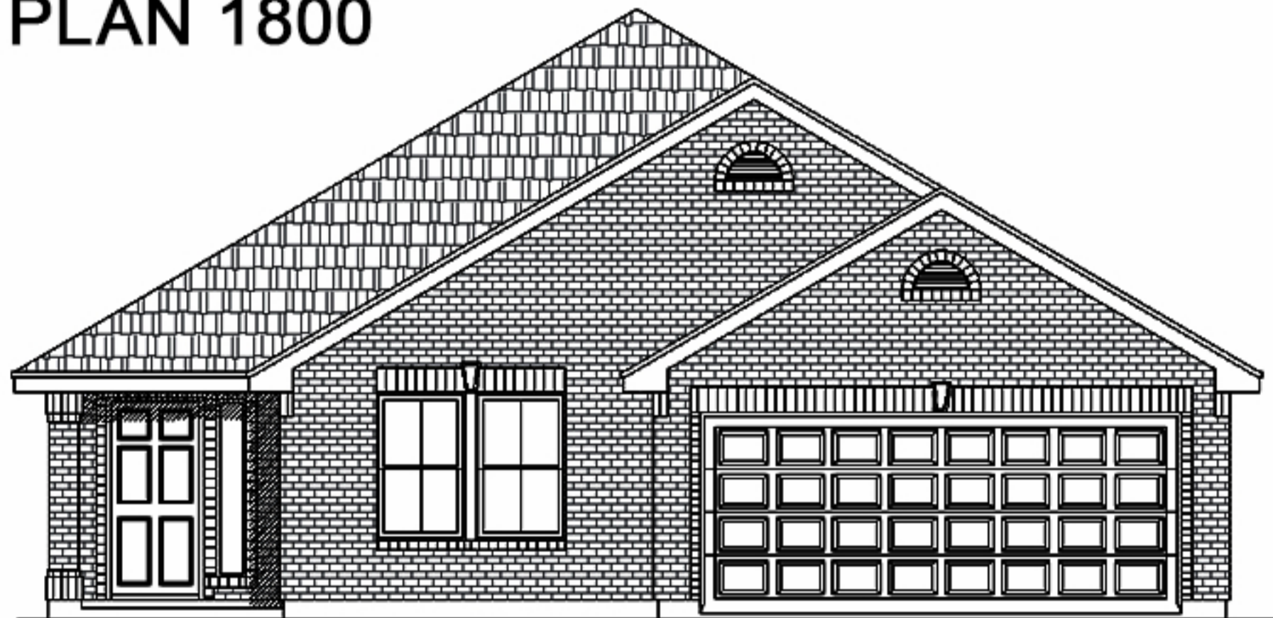
FRONT ELEVATION C PLAN 1800

Brochure plans are artist depictions and may vary from actual plan. Square footages, room dimensions, prices, specifications, materials and availability of homes by community may vary, and are subject to change without notice.