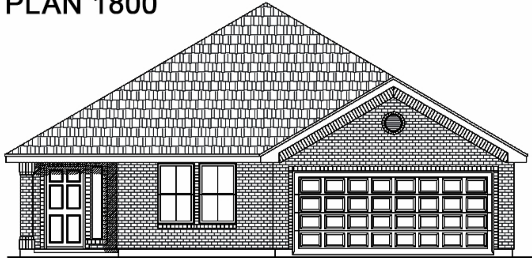
FRONT ELEVATION B PLAN 1800