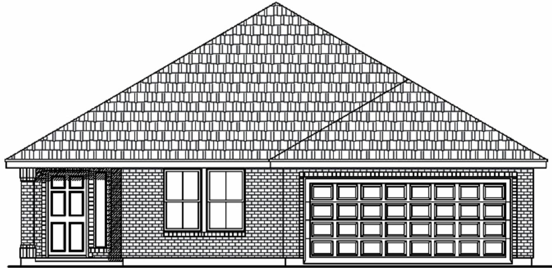
FRONT ELEVATION A PLAN 1800