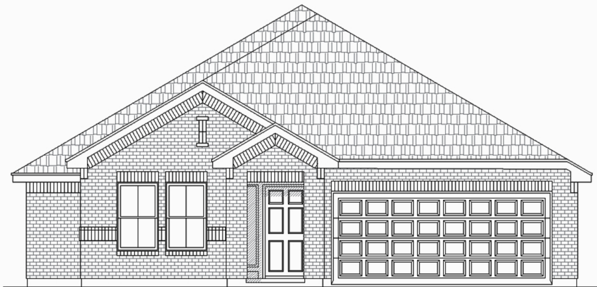
FRONT ELEVATION B PLAN 1816

Brochure plans are artist depictions and may vary from actual plan. Square footages, room dimensions, prices, specifications, materials and availability of homes by community may vary, and are subject to change without notice.