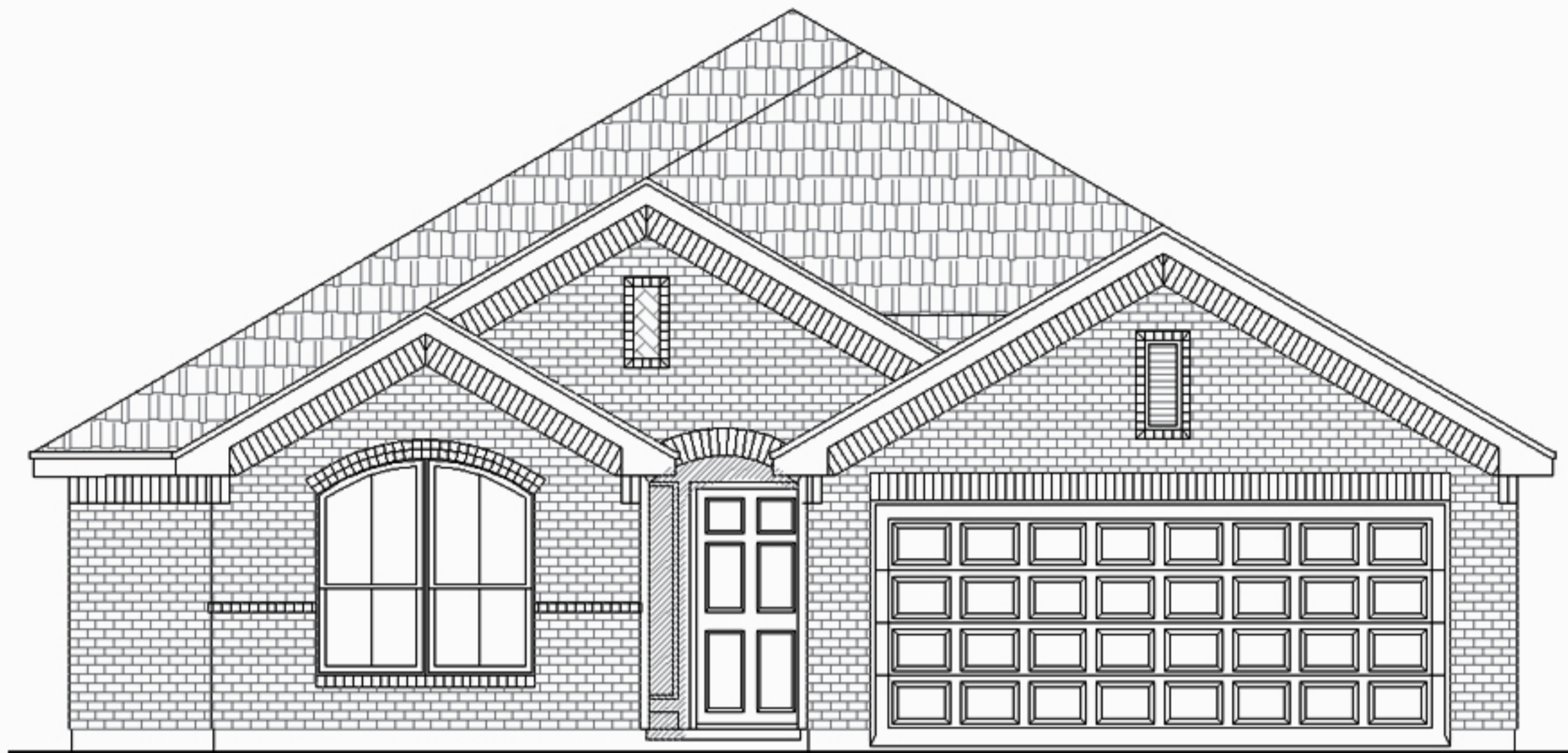
FRONT ELEVATION A PLAN 1816