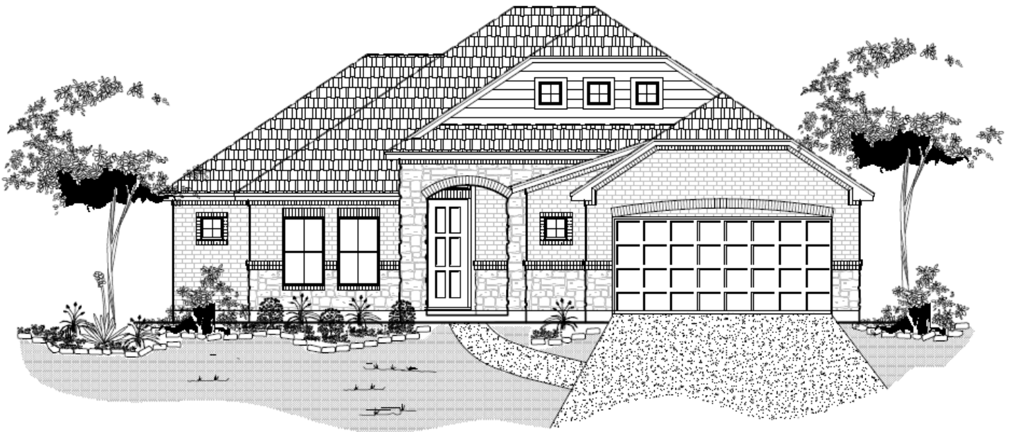
FRONT ELEVATION B Plan 1830