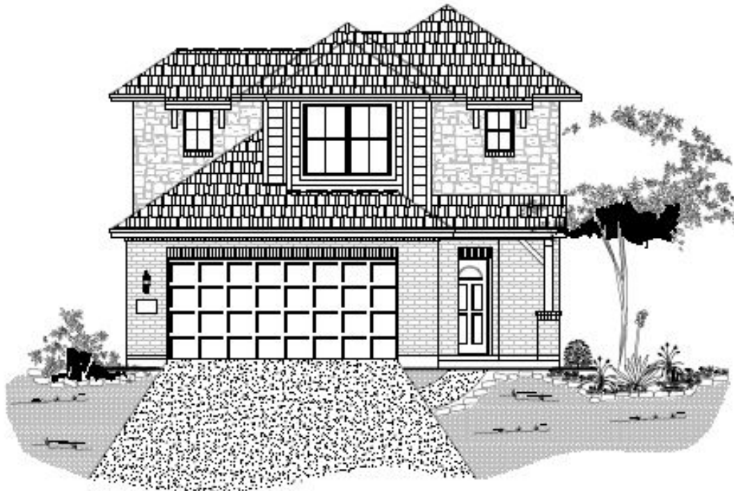
FRONT ELEVATION "M" 1866