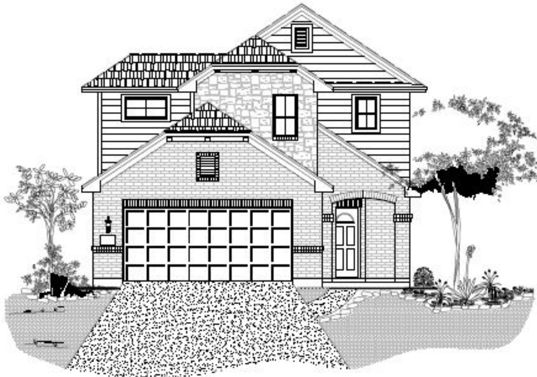
FRONT ELEVATION "M2"

Brochure plans are artist depictions and may vary from actual plan. Square footages, room dimensions, prices, specifications, materials, and availability of homes by community may vary, and are subject to change without notice.