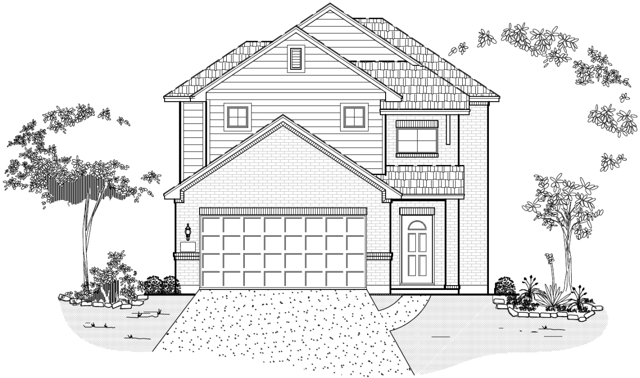
FRONT ELEVATION M2

Brochure plans are artist depictions and may vary from actual plan. Square footages, room dimensions, prices, specifications, materials, and availability of homes by community may vary and are subject to change without notice.