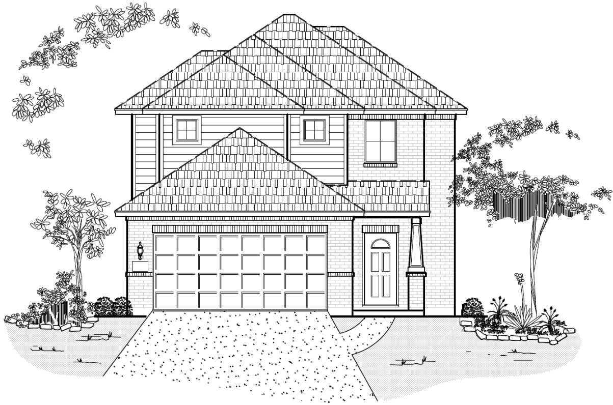
FRONT ELEVATION M