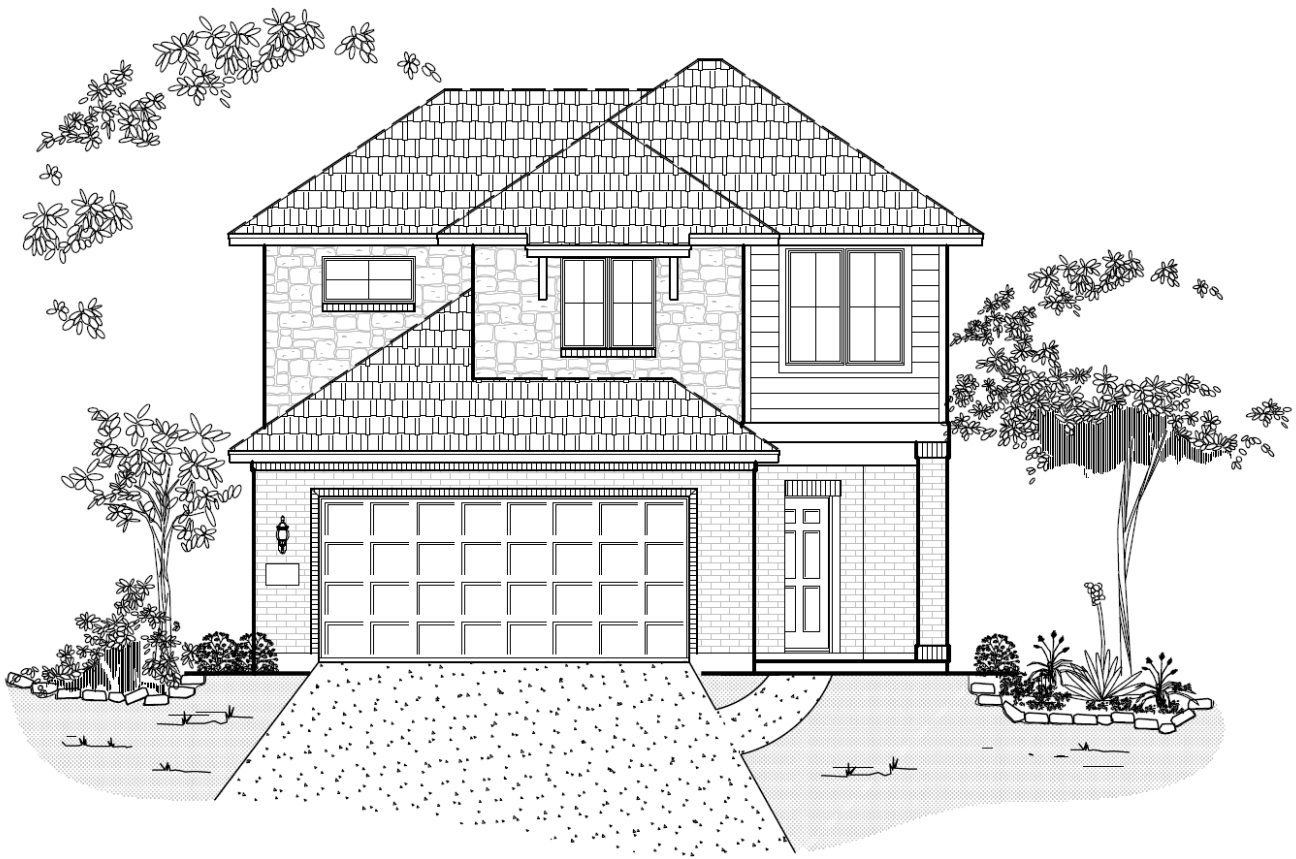
FRONT ELEVATION M