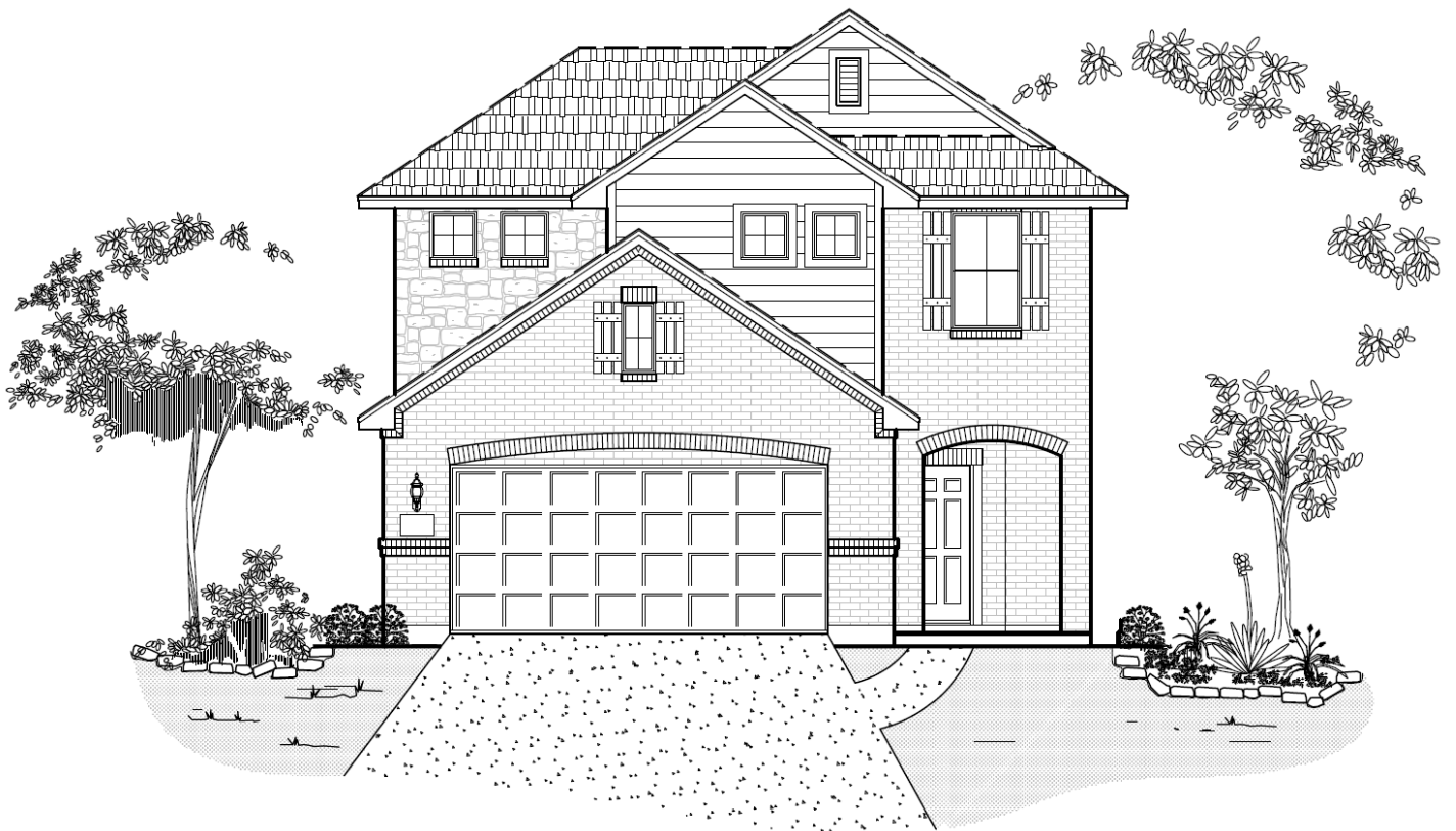
FRONT ELEVATION M2

Brochure plans are artist depictions and may vary from actual plan. Square footages, room dimensions, prices, specifications, materials, and availability of homes by community may vary and are subject to change without notice.