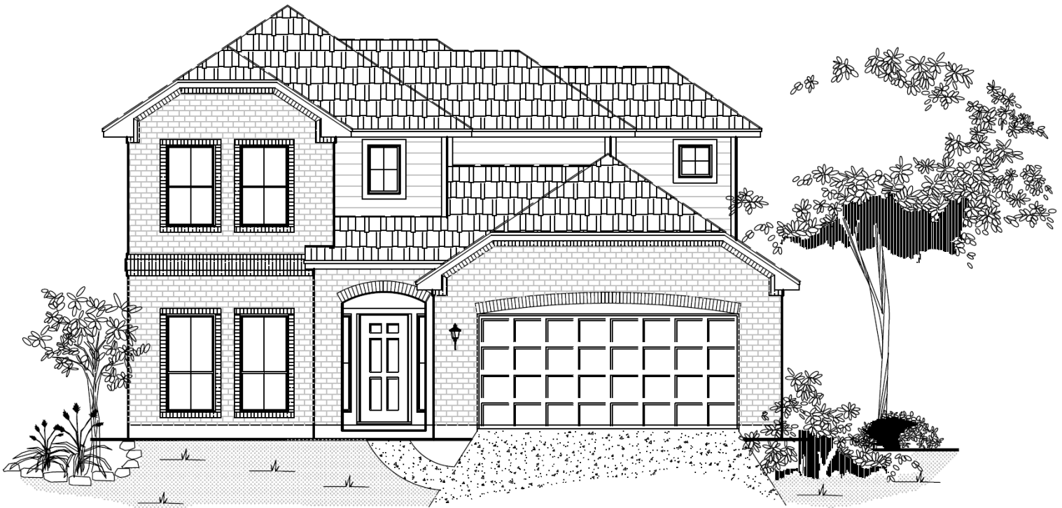
FRONT ELEVATION B

Brochure plans are artist depictions and may vary from actual plan. Square footages, room dimensions, prices, specifications, materials, and availability of homes by community may vary and are subject to change without notice.