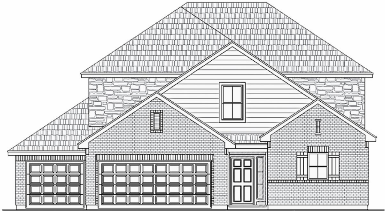
FRONT ELEVATION M PLAN 2365 3-CAR GARAGE