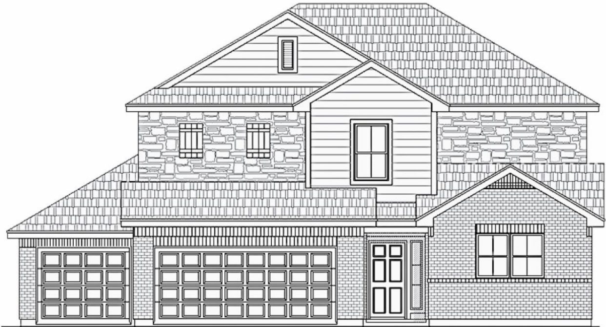
FRONT ELEVATION M2 PLAN 2365 3-CAR GARAGE

Brochure plans are artist depictions and may vary from actual plan. Square footages, room dimensions, prices, specifications, materials, and availability of homes by community may vary and are subject to change without notice.