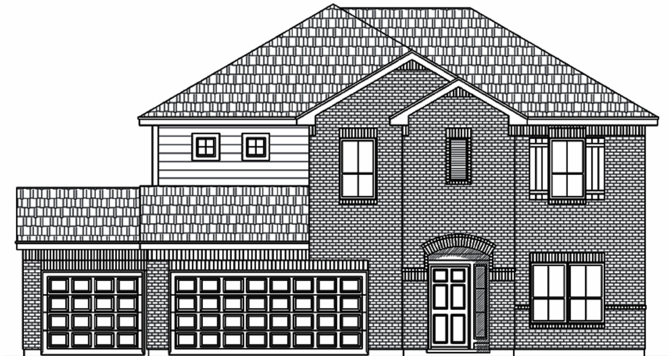
FRONT ELEVATION B PLAN 2377 3-CAR GARAGE

Brochure plans are artist depictions and may vary from actual plan. Square footages, room dimensions, prices, specifications, materials and availability of homes by community may vary, and are subject to change without notice.