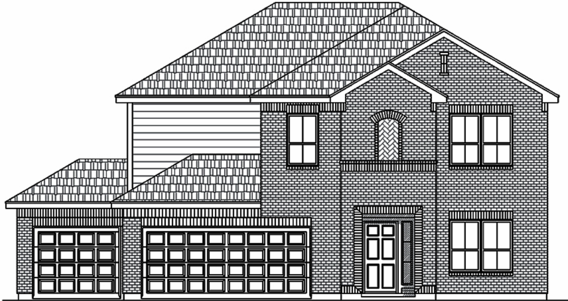
FRONT ELEVATION A PLAN 2377 3-CAR GARAGE