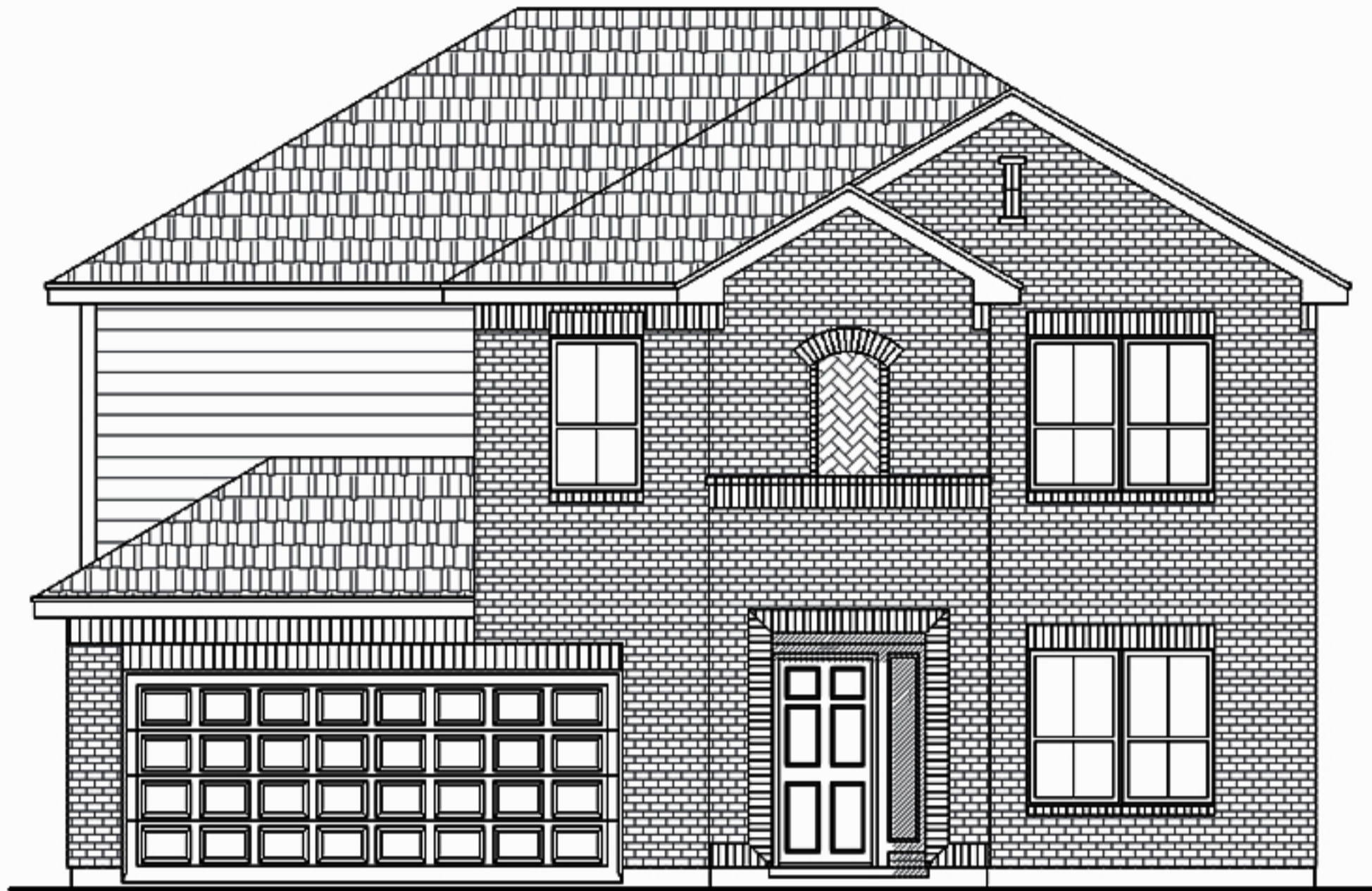
FRONT ELEVATION A PLAN 2377