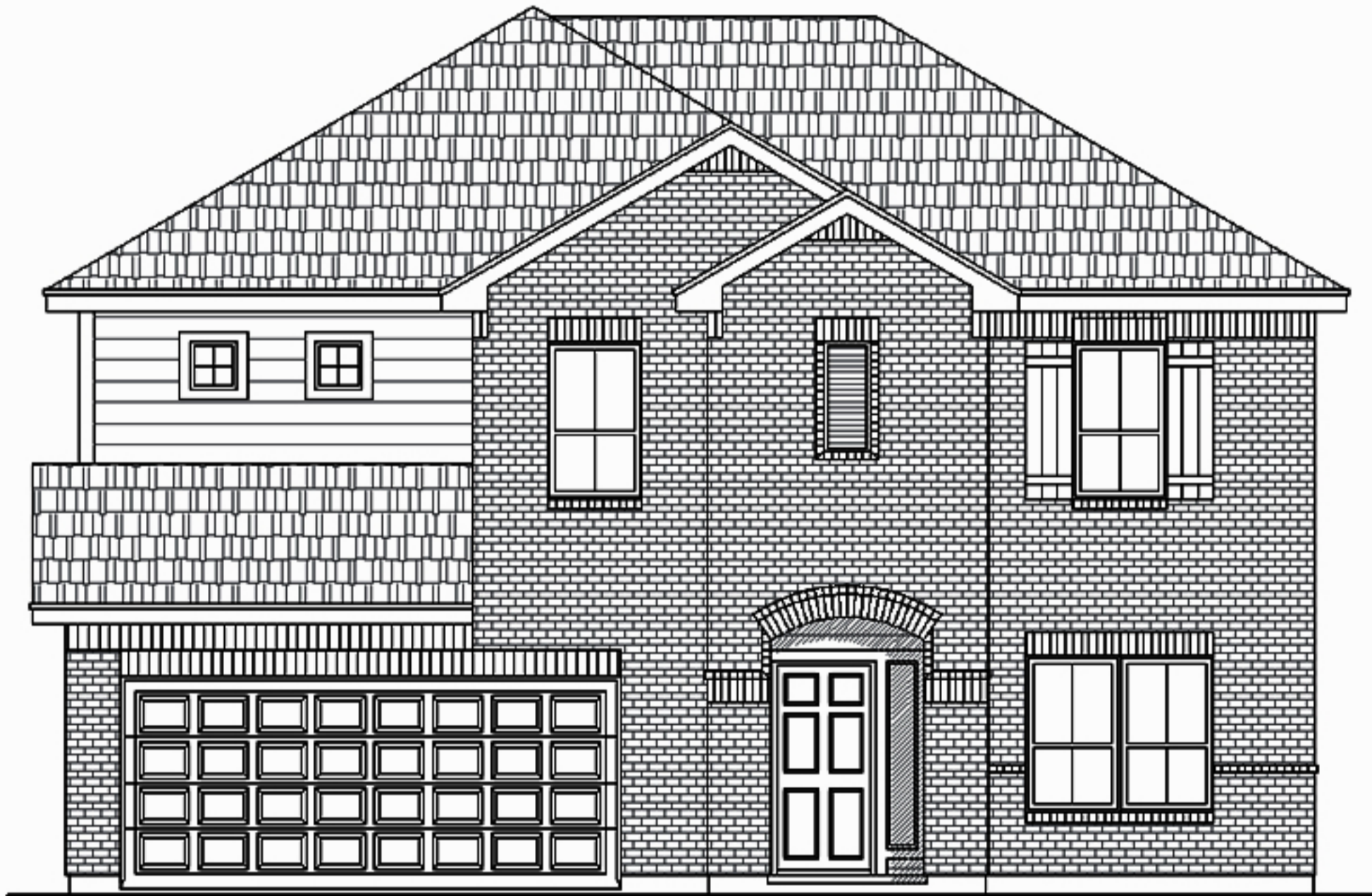
FRONT ELEVATION B PLAN 2377

Brochure plans are artist depictions and may vary from actual plan. Square footages, room dimensions, prices, specifications, materials and availability of homes by community may vary, and are subject to change without notice.