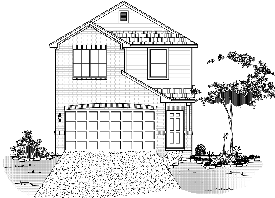
FRONT ELEVATION "A" Plan 1860-ALT.