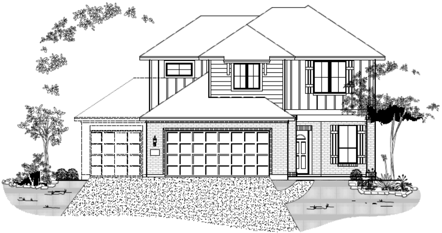
FRONT ELEVATION "A" Plan 2340

Brochure plans are artist depictions and may vary from actual plan. Square footages, room dimensions, prices, specifications, materials, and availability of homes by community may vary, and are subject to change without notice.