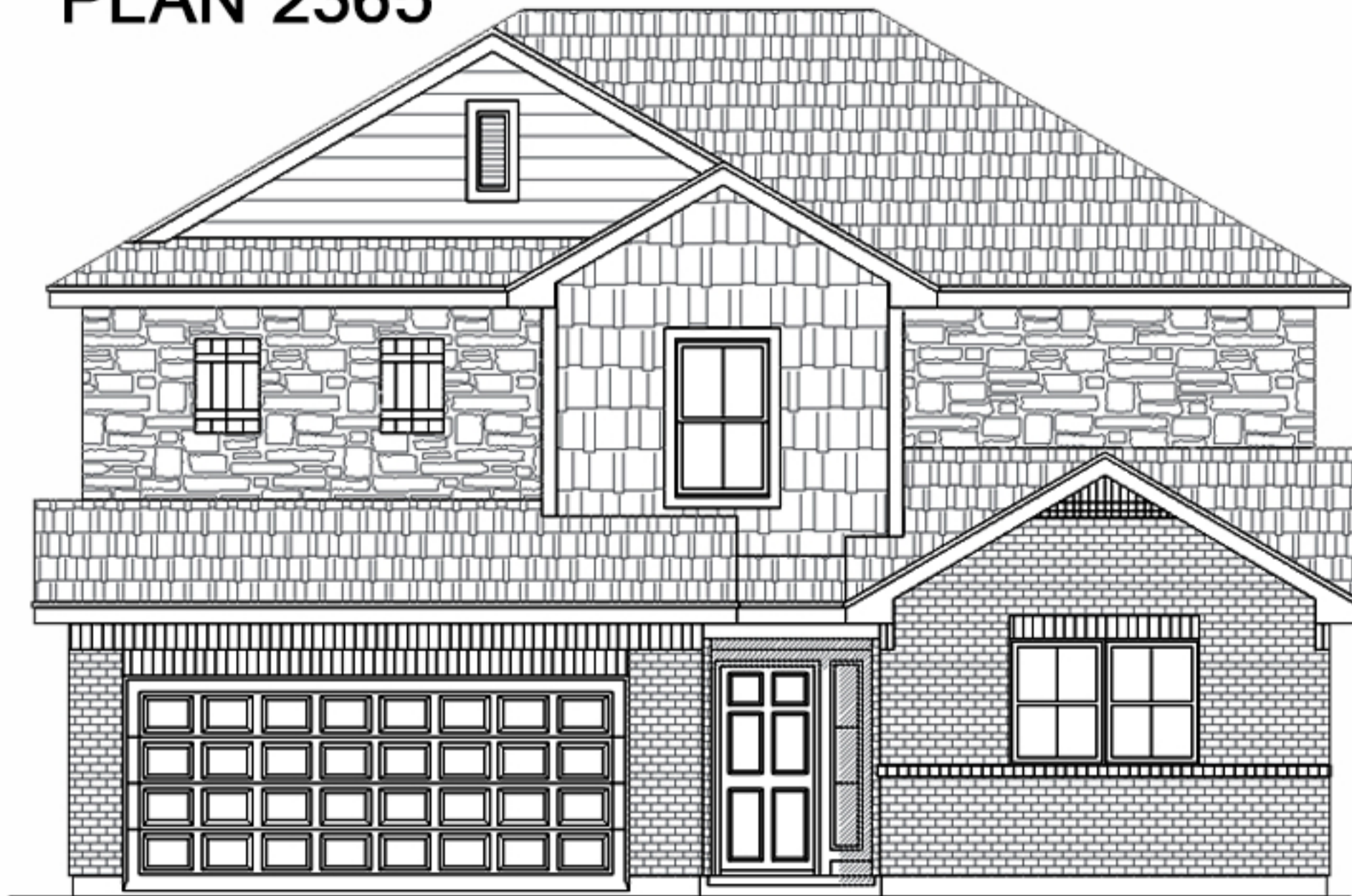
FRONT ELEVATION M2 PLAN 2365

Brochure plans are artist depictions and may vary from actual plan. Square footages, room dimensions, prices, specifications, materials and availability of homes by community may vary, and are subject to change without notice.