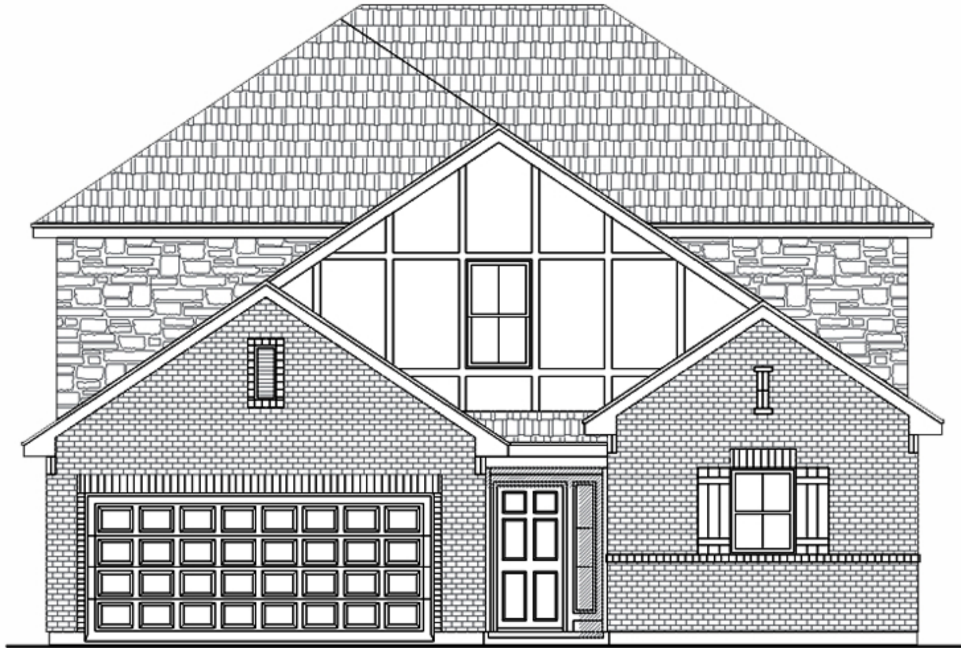
FRONT ELEVATION M PLAN 2365